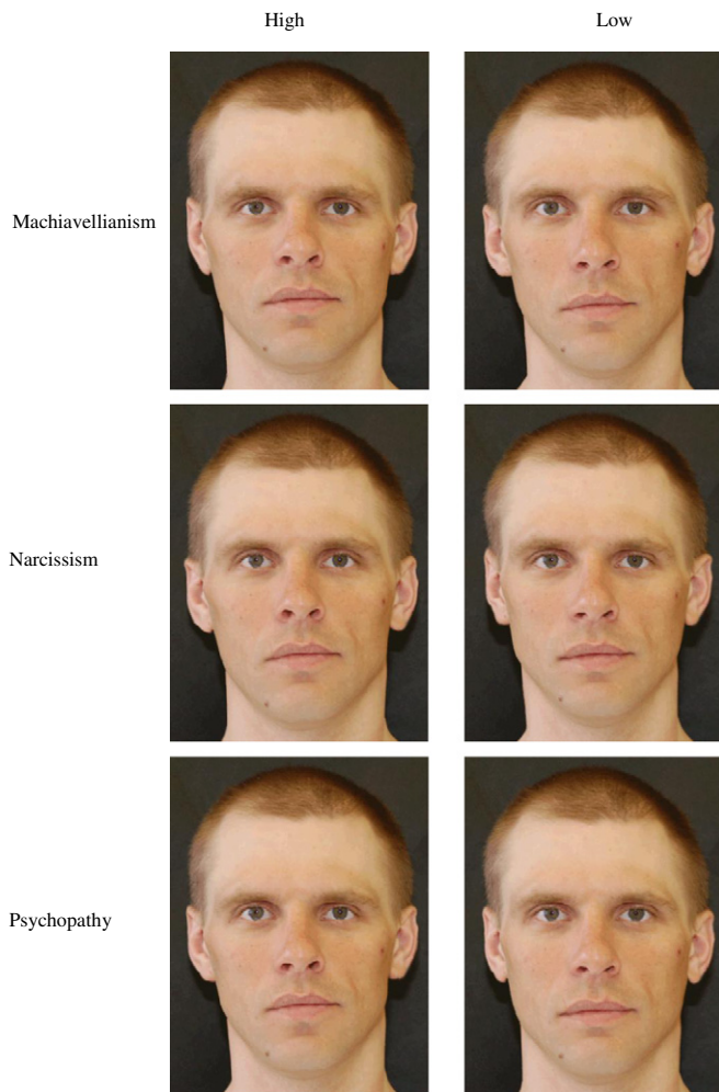
Fig. 1. Example of manipulated stimuli faces high and low in three Dark triad features.

are insensitive to sample size (West et al., 2012). Because of our high sample size, we thus place more weight on the fit-indices than on the \chi^2 test. After setting all the non-significant residual covariances to zero (Green & Thompson, 2012), the model ( n = 1962 ; \chi^2_{MLR} = 7.0000 , df = 6 , p = 0.32 ; RMSEA (90% CIs) = 0.009 (0.000, 0.032), p = 1.00 ; SRMR = 0.009; CFI = 0.998; TLI = 0.991) fitted the data well.